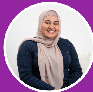
Executive Director/NDIS Provider Building Abilities Disability Services

Discover the difference that Building Abilities Disability Services can make in yours and the participants life. Contact us today to begin this new journey full of abilities.